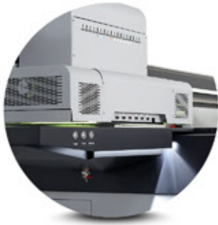
Integration UV Curing System