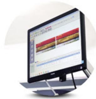
Special Color Profiles