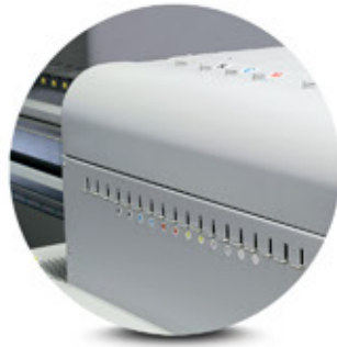
Konica Minolta / 9-14 Picolitre 1024 / 1024i / CMYK + LC + LM + W + V up to 12 print heads.