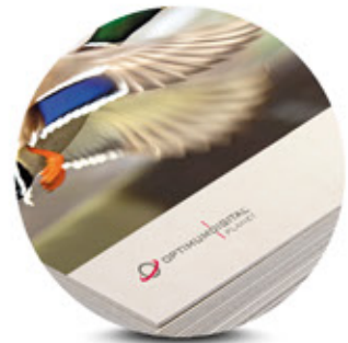
CARTON - CARDBOARD

and you can print with photograph-quality on many similar materials!..